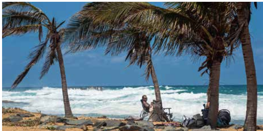
When will the crowds flock back to the beaches?

It seems likely that Puerto Rico will become a state eventually. But to manage that transition, without risking a violent nationalist repulse, it needs to do so from a position of relative strength, not in its current shattered state. The island's government seems to know what is required. Its fiscal overseers will try to keep it moving. If they succeed, the economy will start growing sustainably and the flood of emigration will slow. Or else the brain-drain will become a demographic death-spiral, leaving the island with too few taxpayers to cover its costs. The horrific aftermath of Hurricane Maria might almost be considered an augury of what that would look like, every day. ■